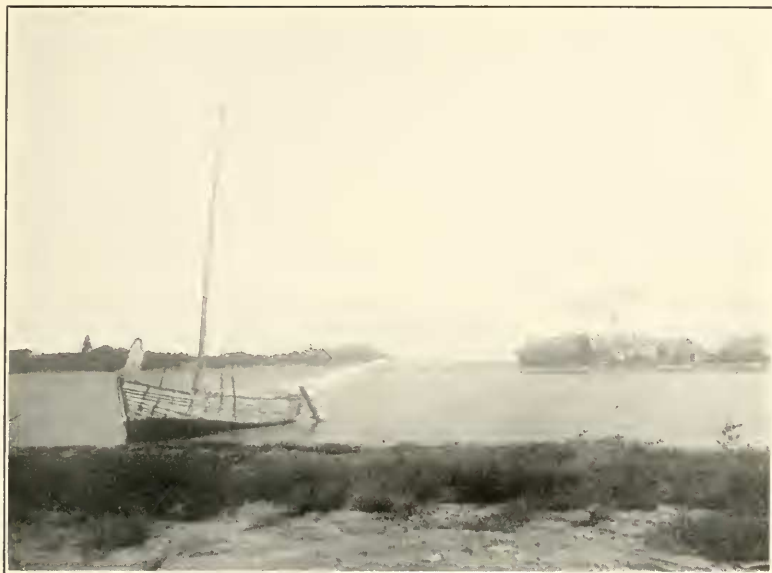
FERET BAY. Île à Vache, Haiti, April 29, 1931.